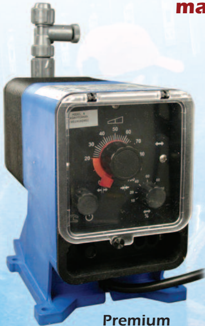
Premium Solenoid Pump

“Sanitize milking gloves, manual back flush milker units, and any other milk contact surface that you want to kill mastitis causing bacteria.”