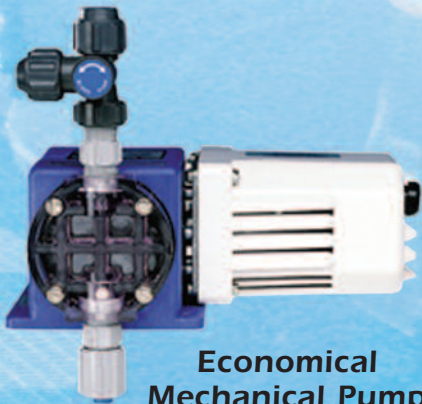
Economical Mechanical Pump