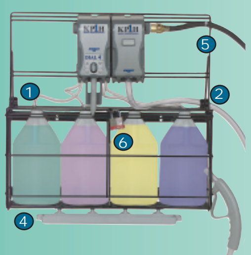
Top View: Wire Rack Without Dispenser Top

The KP1H Wire Rack System provides many useful features for a clean, safe, secure, and professional installation. This economical system features an optional Dispenser Top that snaps into place and accepts any combination of KP1H Proportioners to service any chemical proportioning application.