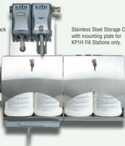
Stainless Steel Storage Center with mounting plate for KP1H Fill Stations only.