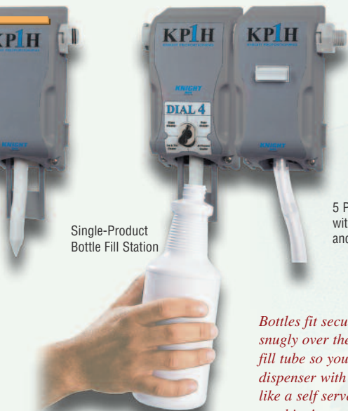
Single-Product Bottle Fill Station