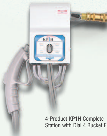
4-Product KP1H Complete Station with Dial 4 Bucket Fill

The KP1H Complete Fill Station is ready for installation right out of the box. All you do is mount the dispenser on the wall and hook up the chemical and water lines. It's just that simple.