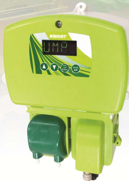
UMP Hospitality 200D Dry Detergent Dispenser