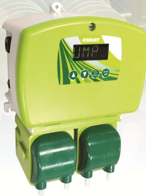
UMP Hospitality 200L Liquid Detergent Dispenser