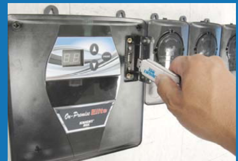
USB uploading and downloading