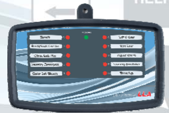
Low Level Alarm Module