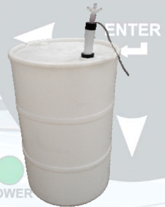
Low Level Alarm 43" Probe