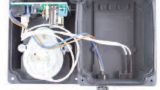
Durable, long life motor