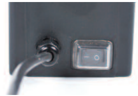
Power switch is protected by a flexible, water resistant seal