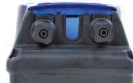
Quick disconnect for suction and discharge tube connections