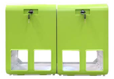
Single Cabinet with dispenser mounting bracket (dispenser not included)