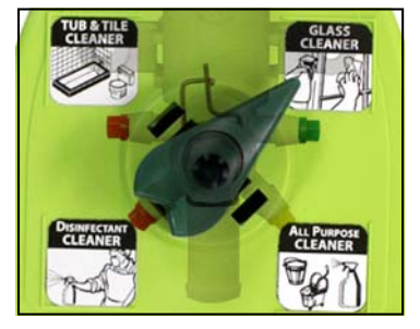
Suction ports match directional dial for easy chemical installation.