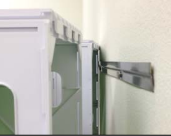
Hang the dispenser on joggle bracket for simple mounting and servicing.