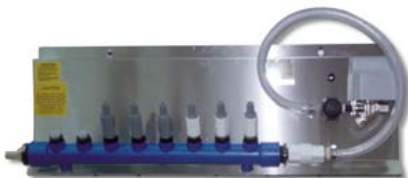
Low Flow Flush Manifold with 1/4" Water Solenoid Valve

When the highly corrosive laundry chemicals are dispensed by the peristaltic pumps into the Flush Manifold, the unique flush mode of the control opens the built-in water solenoid to provide a diluted flush to the washer through a single injection line. Concentrated chemicals can now be dispensed with less chemical shock to the fabrics being washed. The external high flow check valves prevent back-siphonage as well as cross contamination of chemicals.