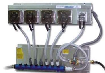
High Flow Flush Manifold with 1/2" Water Solenoid Valve