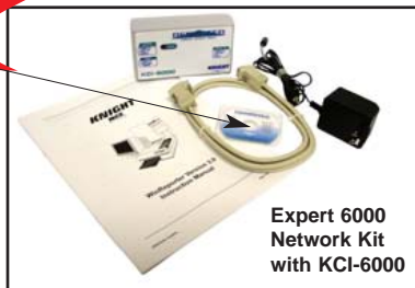
Expert 6000 Network Kit with KCI-6000