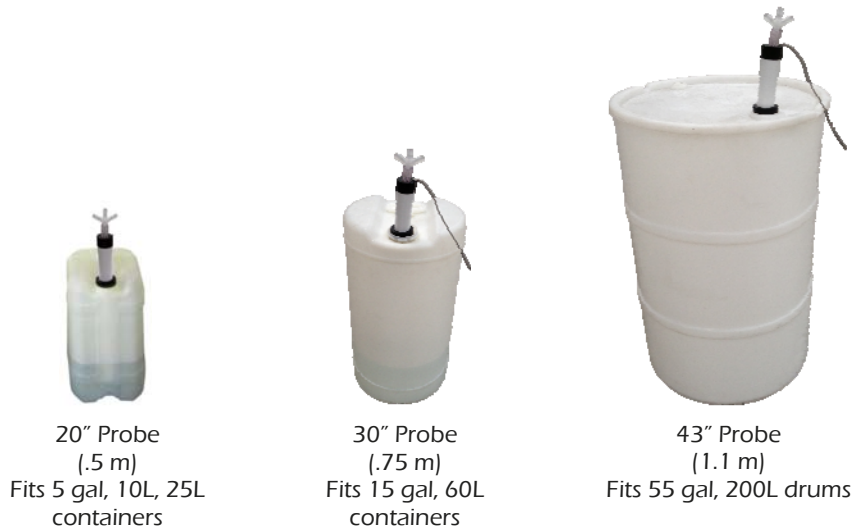
20" Probe (.5 m) Fits 5 gal, 10L, 25L containers