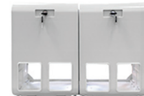
Dual Cabinet with locks