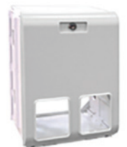
Single Cabinet with locks